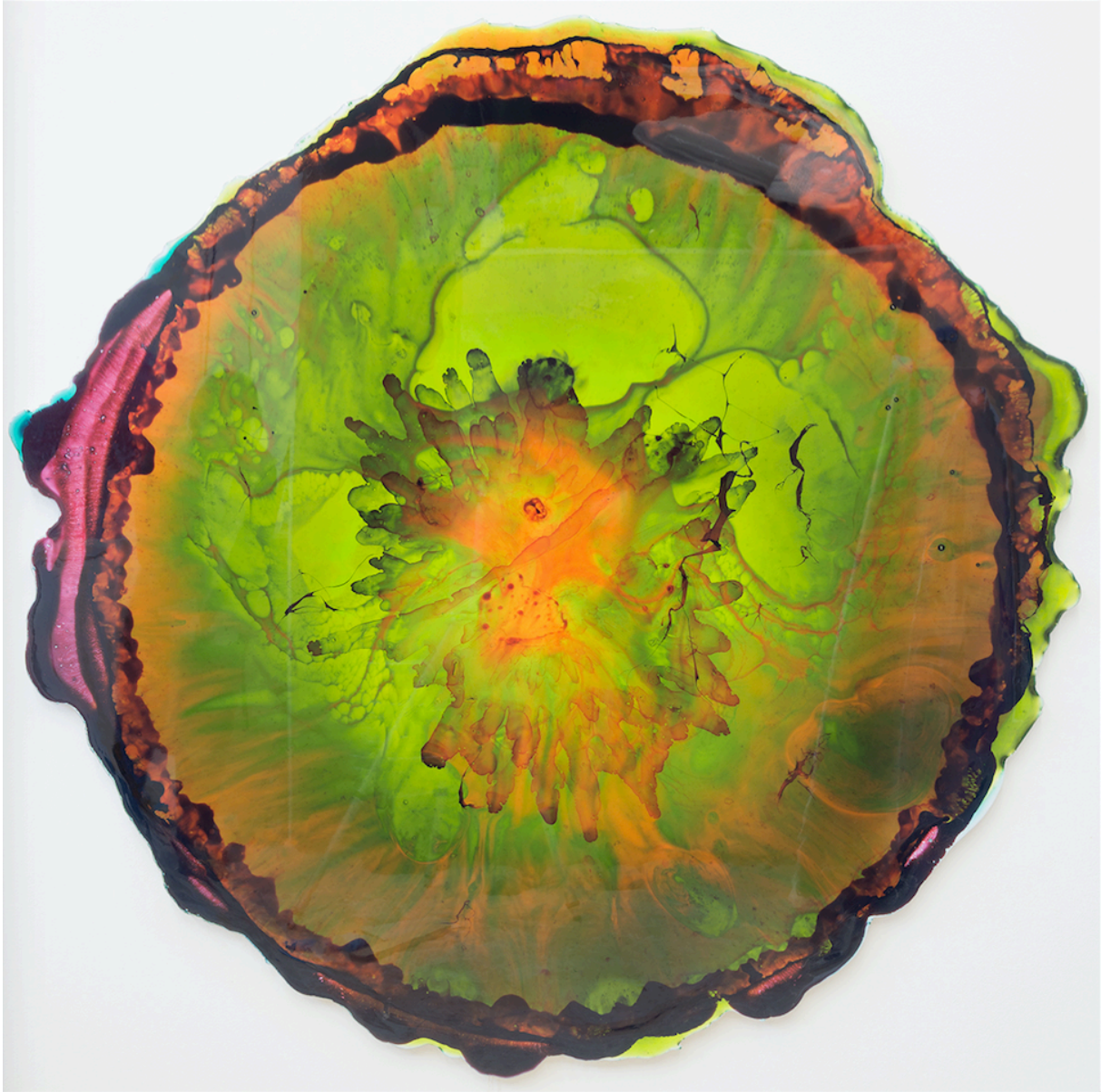
Wolfgang Ganter Vitrail 2017 pigment print on wood under clear resin 152 x 156 cm ed. 3 + 2 AP